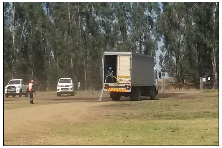
Figure 2: Spraying water for dust control.