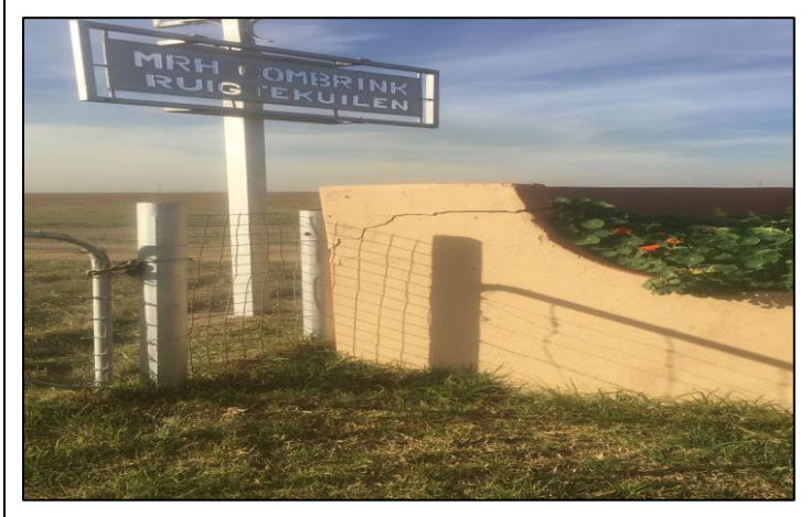
Figure 7: Farmer's damaged gate.